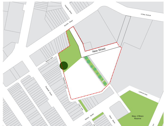
Park and Green Link