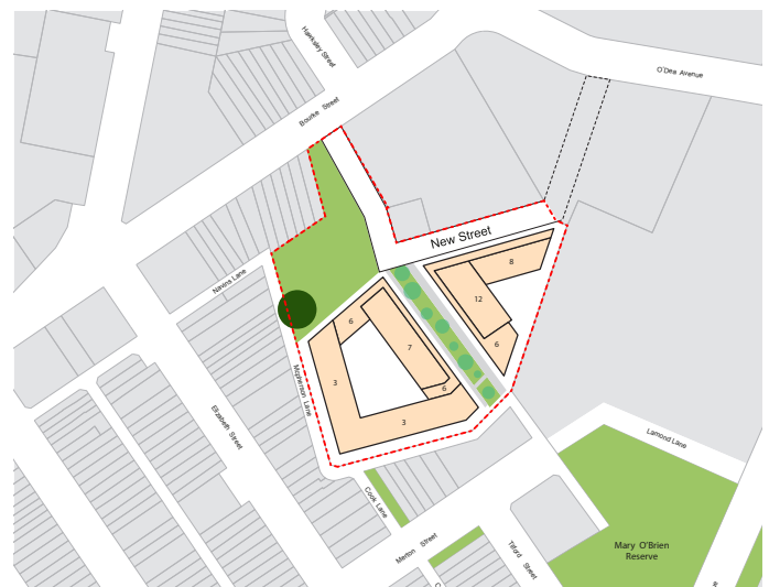
Envelopes and Heights